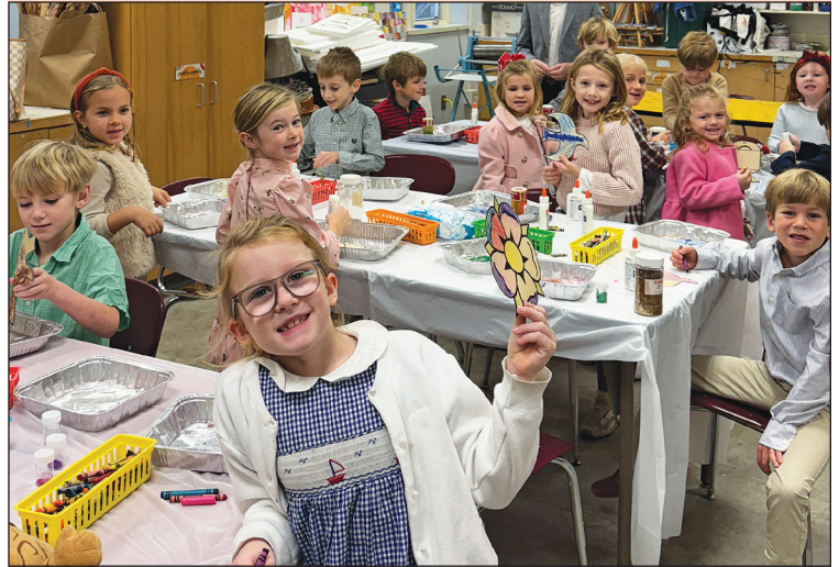
Above: Our 1st grade students made Christmas ornaments for the Advent Christmas tree.