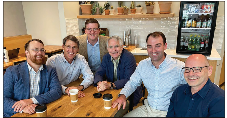
Photo of clergy staff