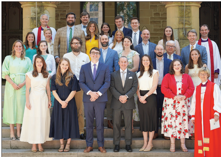
Adults confirmed (above):