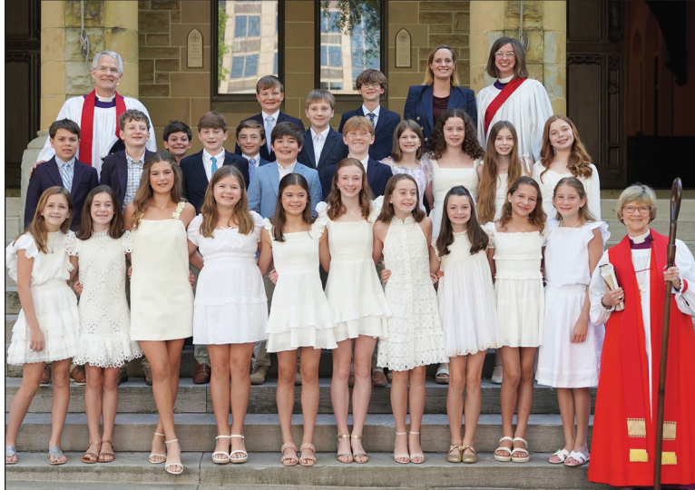
Youth confirmed (above):